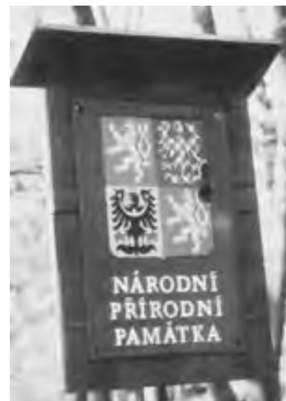
Czech National Park Sign

The Prague Vienna Greenways offers a full diversity of typical Czech countryside reaching from flatlands, countryside with ponds, lakes and marshes, the hills of Czech Merano region in Central Bohemia or the Palava Hills in South Moravia, the